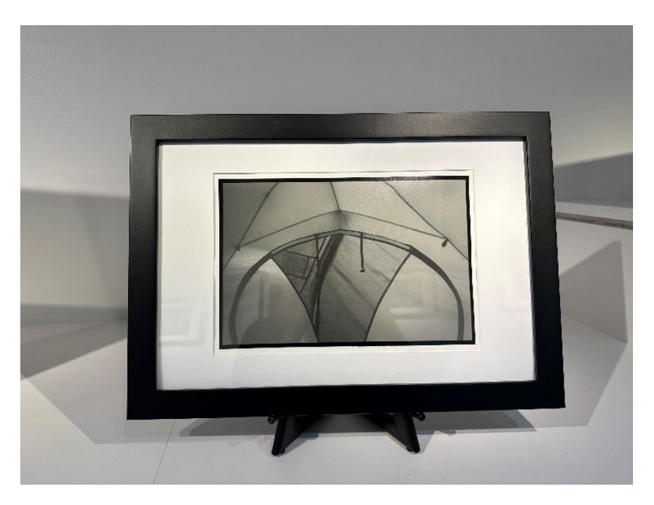
Small wooden easel for framed 2D artwork

Exhibitors are expected to review the below diagram of the display case at Meadows which contains the dimensions of the space. The shelf in the middle of the case is glass and both the front and back of the case are also glass. This means that all displays must be planned to be seen from both the front and back of the case since library patrons will view it from both sides. The glass shelf also must be included in planning- it cannot support 3D artworks of significant weight. Library staff can supply exhibitors with a variety of small easels to support artworks. Installations that require unusual set-ups, including hanging from the ceiling should be noted in the application.