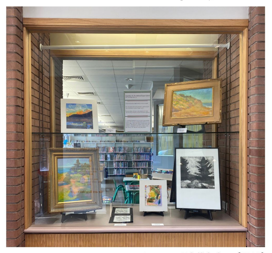
Current Exhibition (2022)