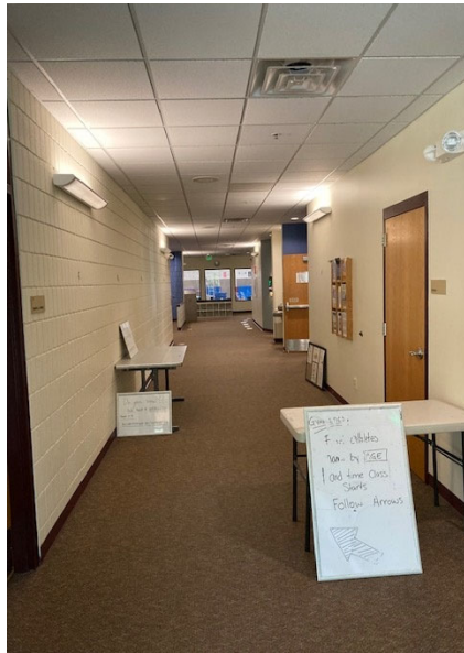
Center view of hallway

Zone 3- Gymnastics Hallway- Go down the side hallway past the weight room. Hooks are located on both side of the walls, beginning near the childcare room, wrapping around the corner to the right, near the gymnastics viewing area.