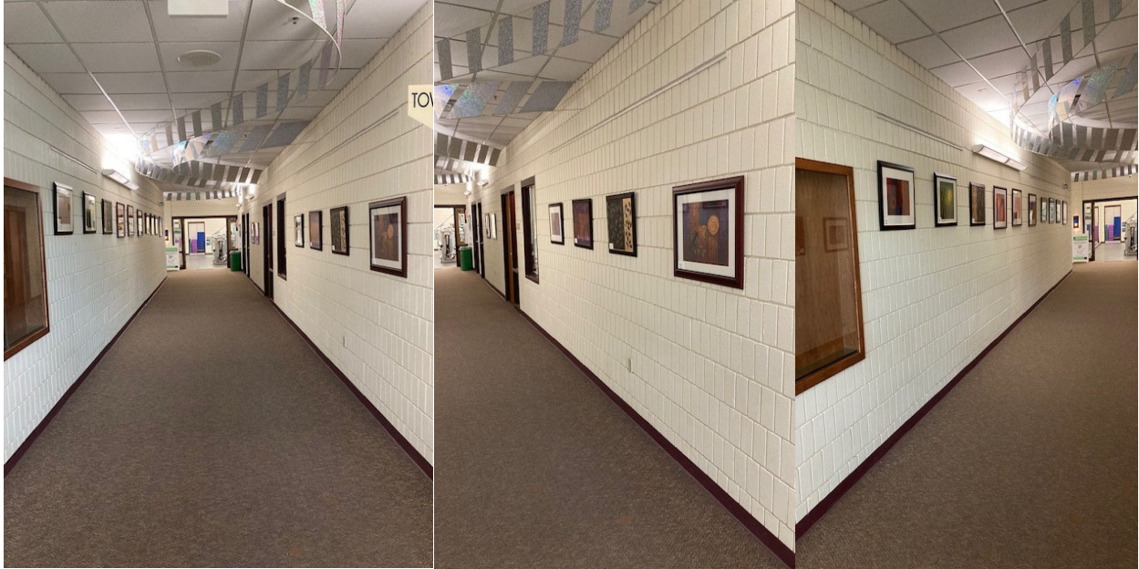
Looking down Center of hallway

Zone 1- Front Main Hallway- Directly past the front desk leading to the weight room entry. Hooks are on right left side walls.