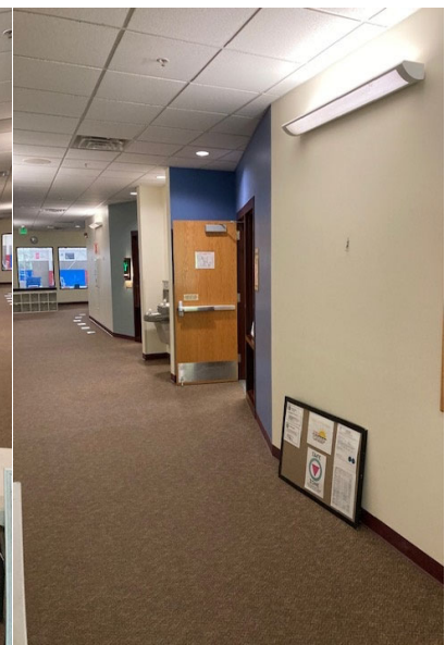
Right side of hallway