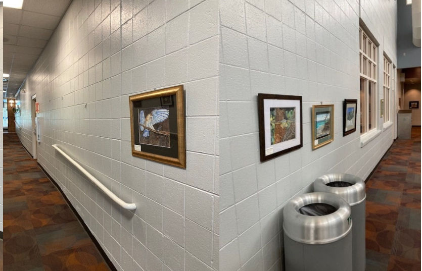
Looking up the ramp