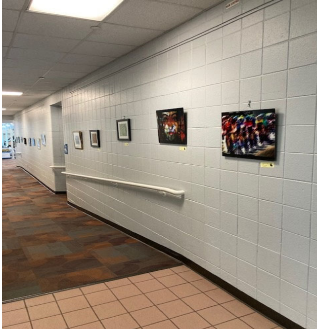
View from the top of ramp, looking down