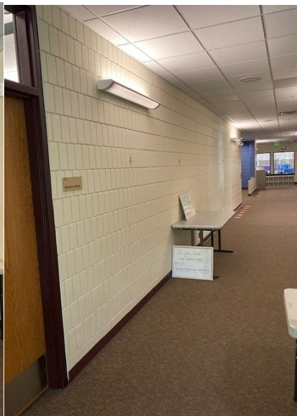
Left side of hallway