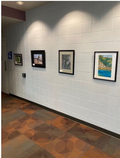
Outside of Women's Locker room

Zone 3- Split between the bottom of the ramp and basketball gym wall- Hooks are located at the bottom of the ramp (left side when looking down), the wall near the entrance to the women's locker room and exterior wall of the basketball gym.