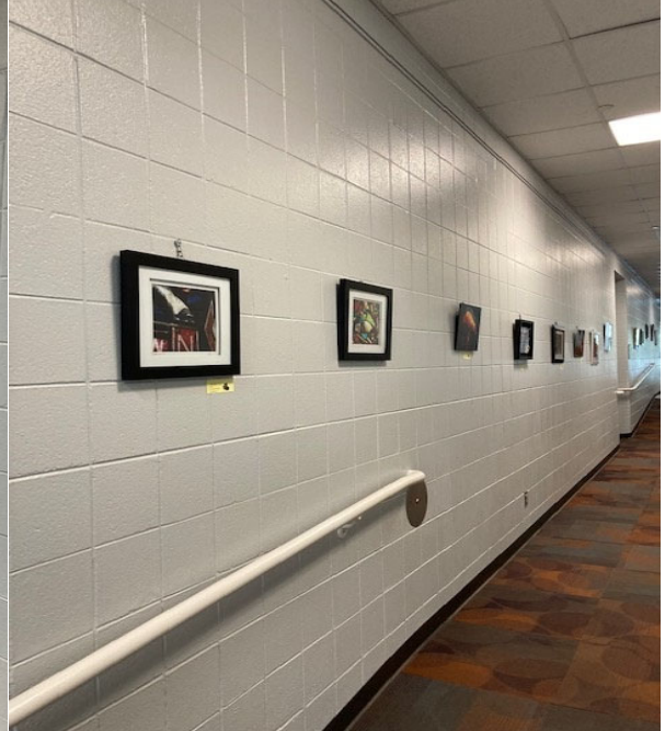
View from the bottom of ramp, looking up

Zone 3- Split between the bottom of the ramp and basketball gym wall- Hooks are located at the bottom of the ramp (left side when looking down), the wall near the entrance to the women's locker room and exterior wall of the basketball gym.